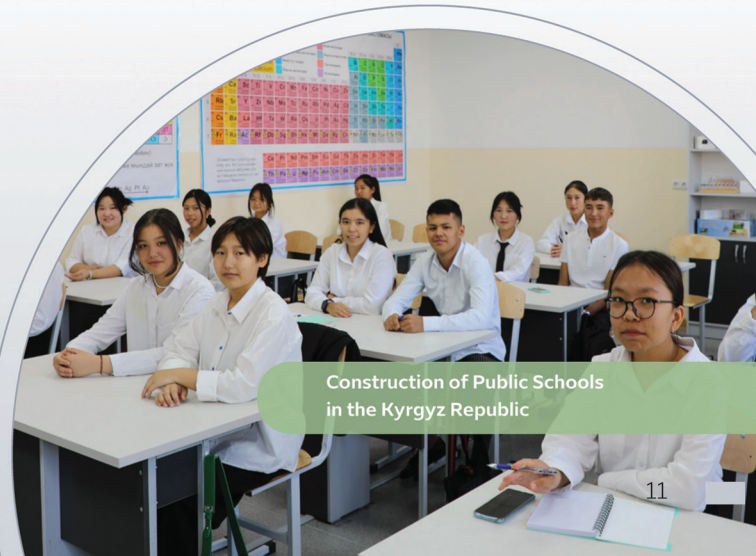
Construction of Public Schools in the Kyrgyz Republic