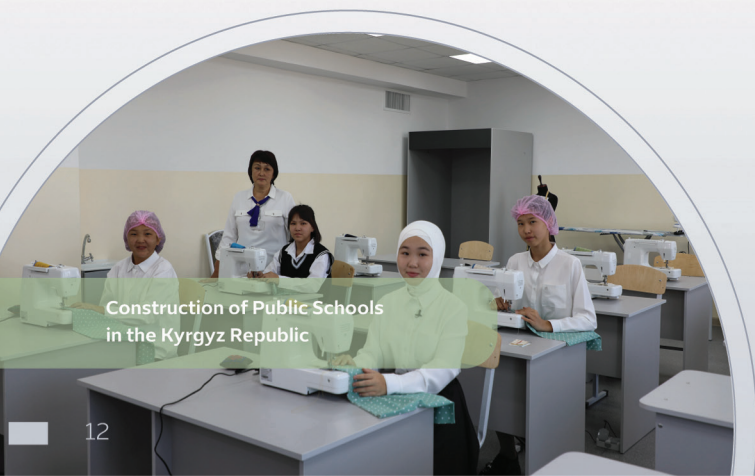
Construction of Public Schools in the Kyrgyz Republic