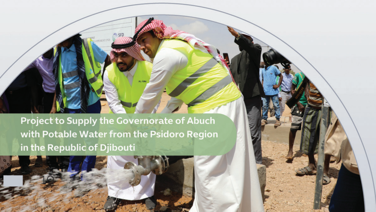
Project to Supply the Governorate of Abuch with Potable Water from the Psidoro Region in the Republic of Djibouti