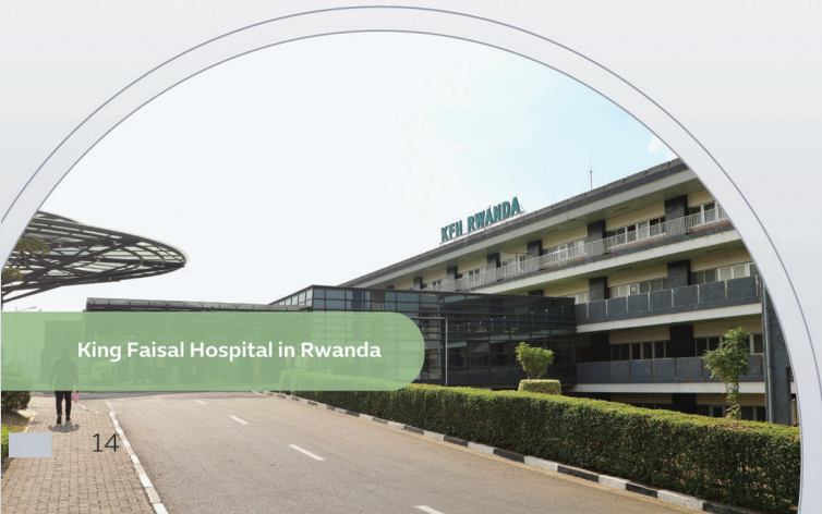
King Faisal Hospital in Rwanda