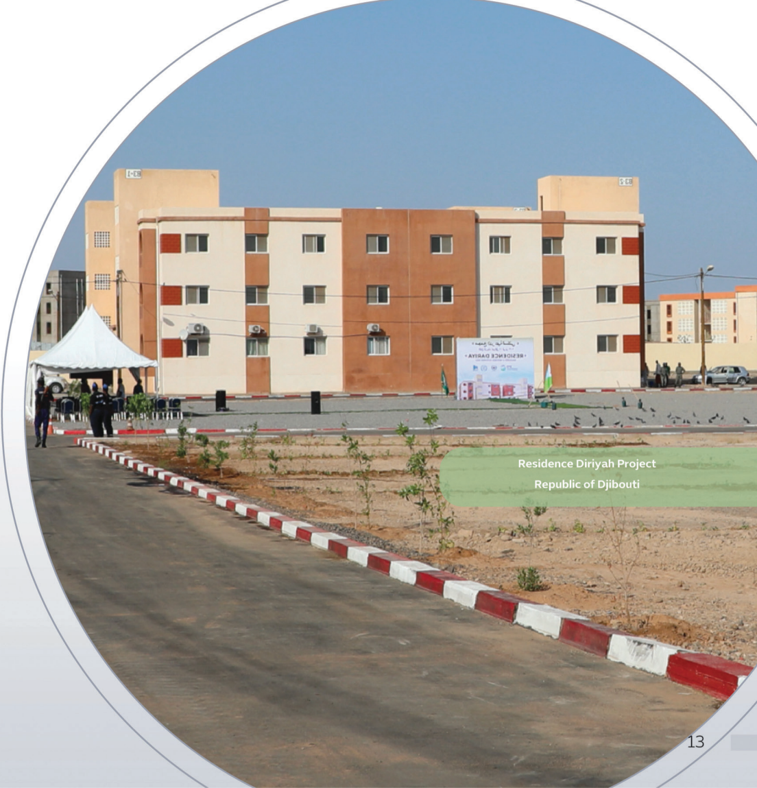
Residence Diriyah Project Republic of Djibouti