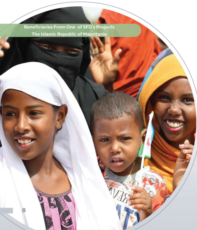
Beneficiaries From One of SFD's Projects The Islamic Republic of Mauritania