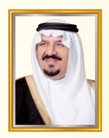
His Royal Highness