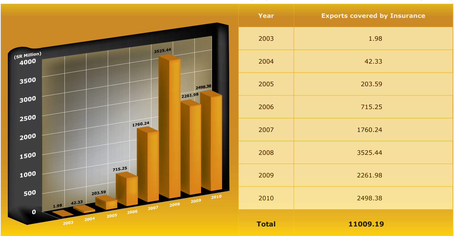
Table (3 - 5) (SR. Million)