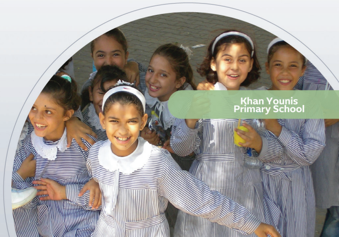
Khan Younis Primary School